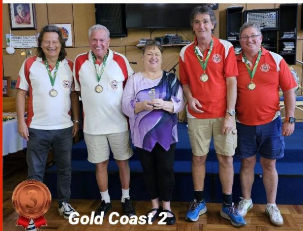
Gold Coast 2