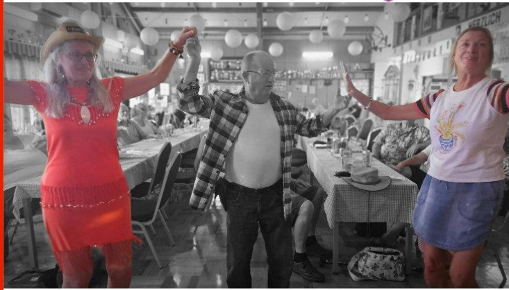
Such a treat!