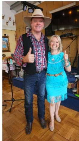
I am a fan 👍