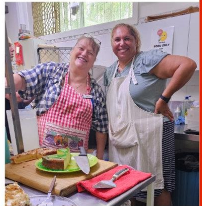
Country Festival – 02/02/2025