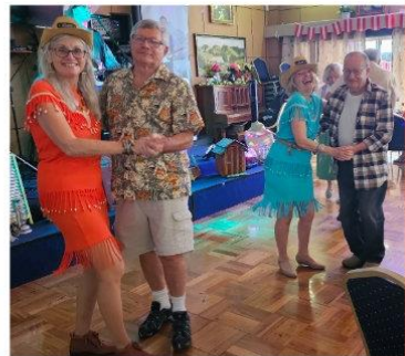
Country Festival - 02/02/2025