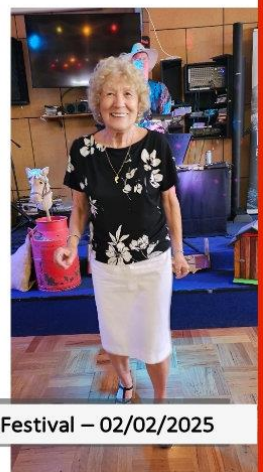
Country Festival – 02/02/2025