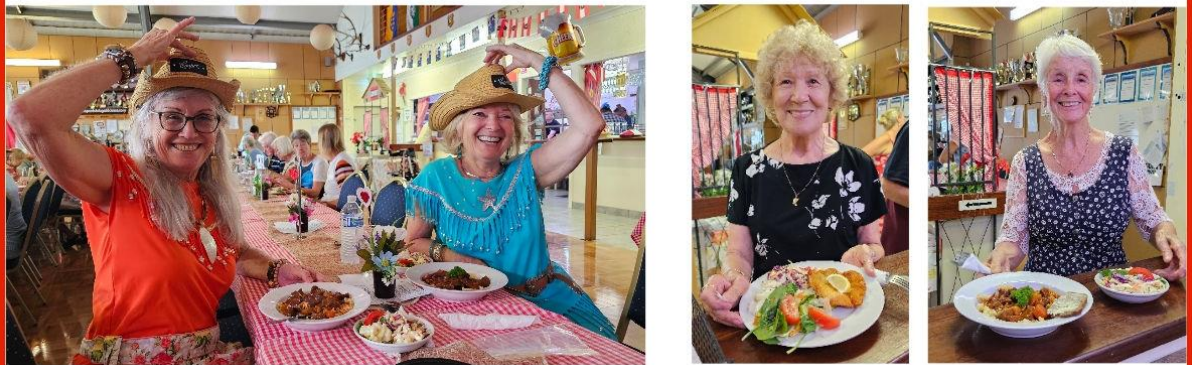
"Hats off to the kitchen team for such a great lunch!"