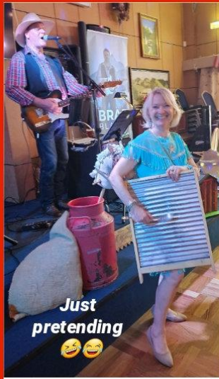
Just pretending 😂😂