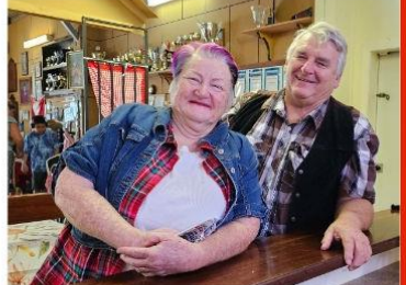
Country Festival – 02/02/2025