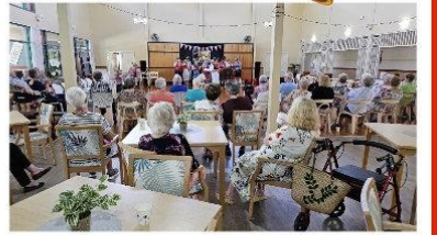
Performance - Aveo Robina 29/10/2024