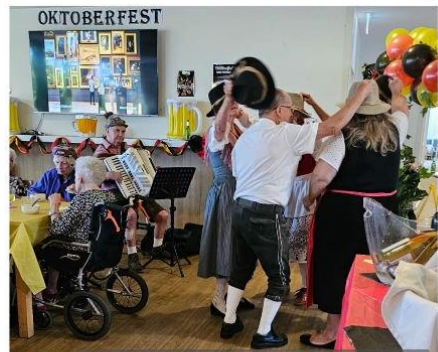
Oktoberfest - Estia 22/10/2024