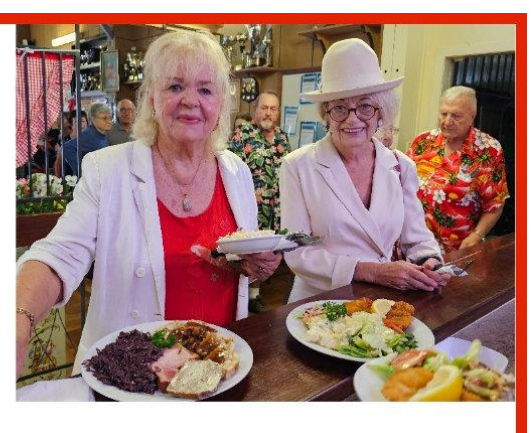
Schnitzel or ...