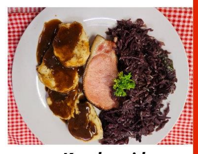
... Kassler with red cabbage and Knödl