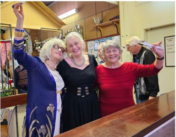
Still Mother's Day – 19/05/2024