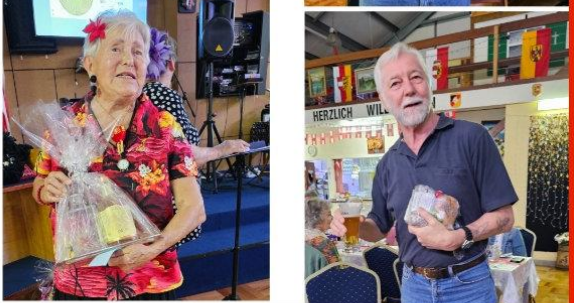
Still Mother's Day - 19/05/2024