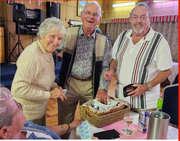
It might be me ...