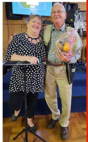
Is it my number ???