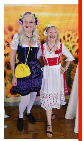
Friends are the flowers in the garden of life.