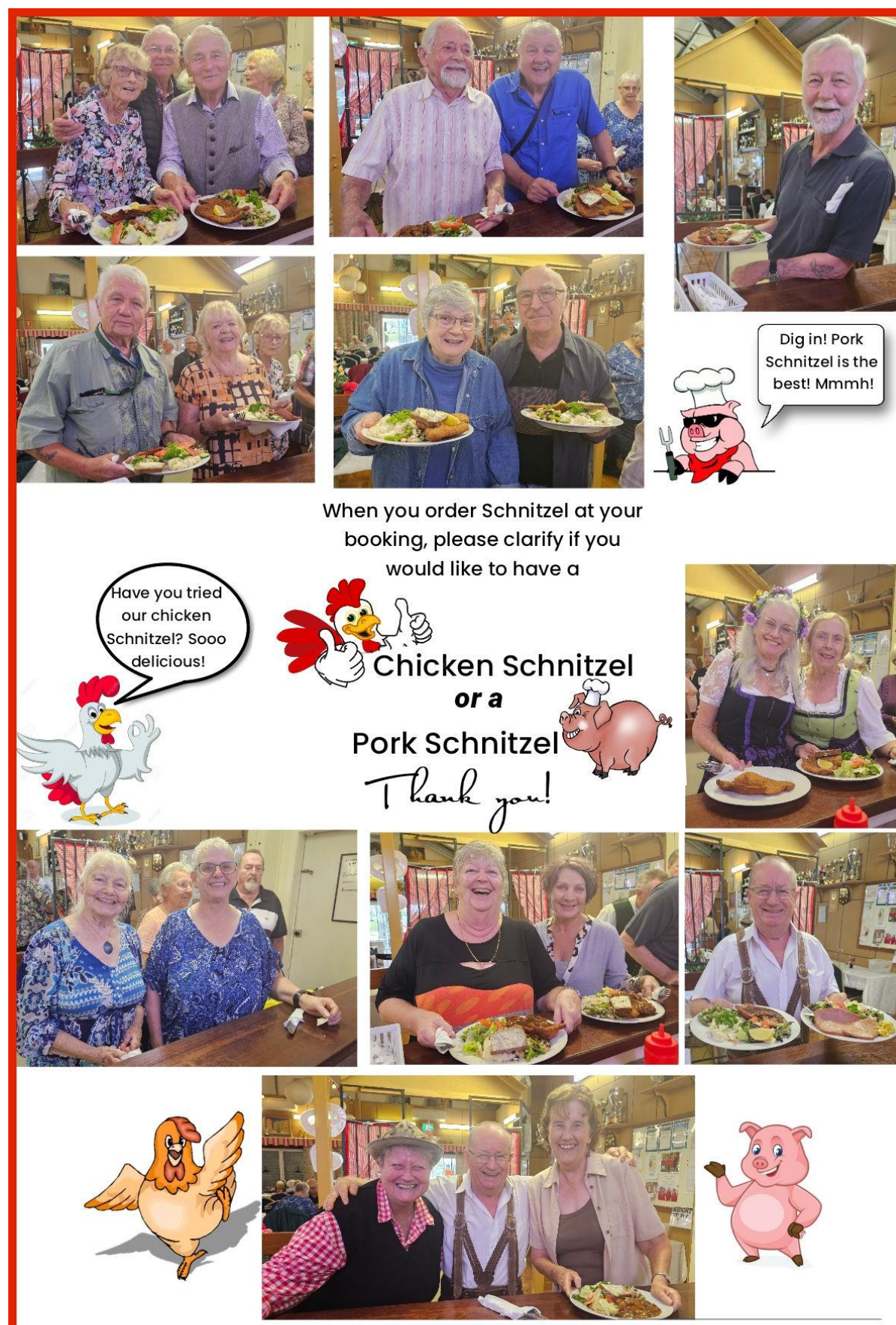
Just Another Luncheon - 21/04/2024