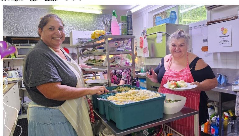
Just Another Luncheon - 21/04/2024

do not necessarily have the time; they just have the heart.