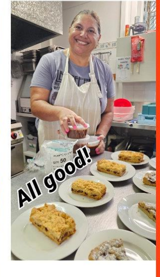
Country Festival – 04/02/2024