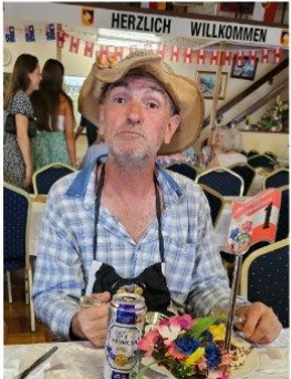
Nobody has been charged!