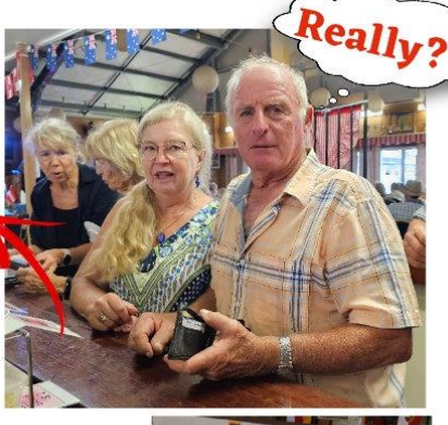
Tony ordered two pieces of cake, just in case ... you never know!!!!